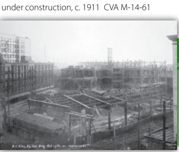
Carrall at Hastings, c. 1915 VPL 8395

425 Carrall Street (or 2 West Hastings) Somervell & Putnam, 1911-12