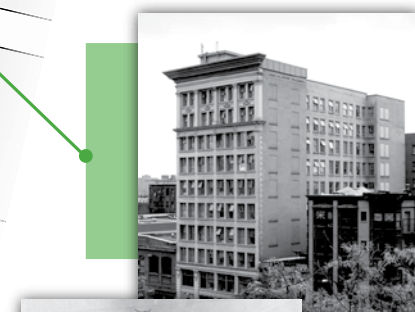
under const., c. 1911 VPL 13682

16 East Hastings Street W.T. Whiteway, 1910-11