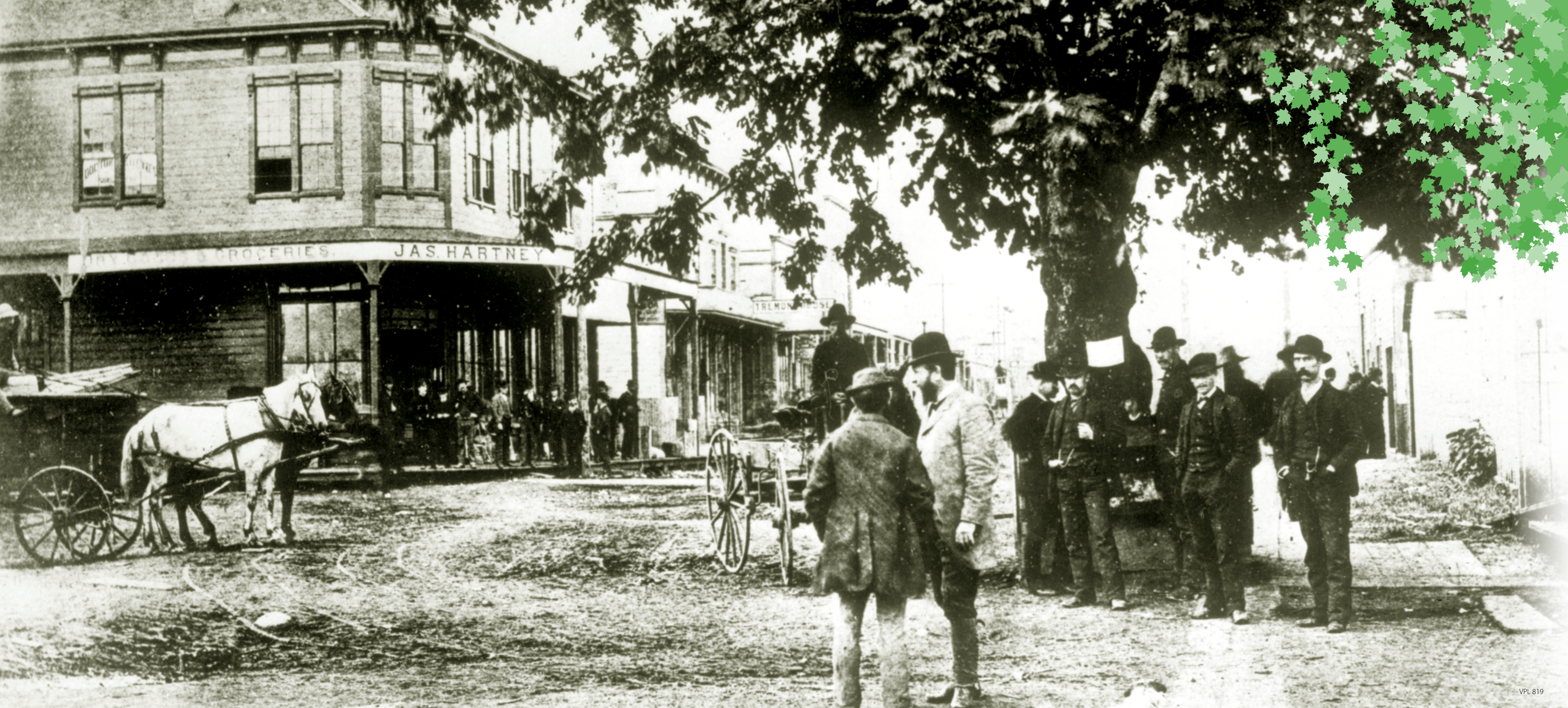
MAPLE TREE SQUARE, c. 1886 (VPL 819)

This is where an enormous maple tree stood that gave the square its name. The tree became the town meeting place and notice board. Gassy Jack Deighton's saloon was in the shade of the maple tree towards the water. This area was also part of the Coast Salish village called "Luk'luk'l". Vancouver's first strike meeting (Hastings Mill workers) was held at Maple Tree Square. The tree was lost during the great fire of June 13th, 1886 however the intersection of Water and Carrall Streets where it was located has retained its importance to the city and is still known as Maple Tree Square.