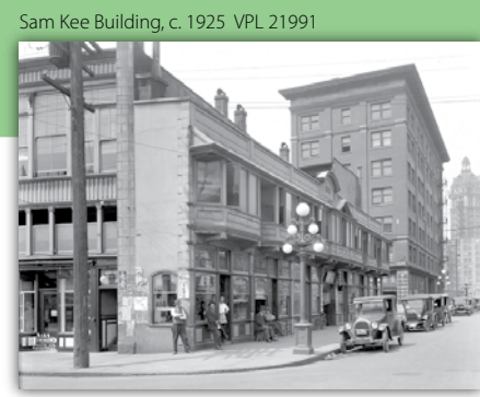
Sam Kee Building, c. 1925

8 West Pender Street Brown and Gilliam, 1913